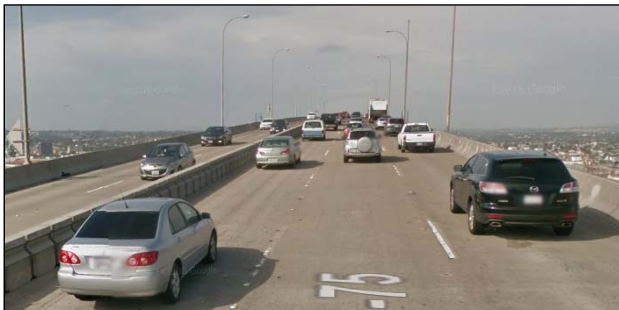
Figure 5: Northbound view of CA-75 on the Coronado Bridge

This system allows a central traffic lane across the bridge to have its direction of flow altered at any point and provides a clear indication to motorists when the lane is available due to the nature of the barrier. This also means that there is no need for additional signalisation to provide motorists with lane designation information.