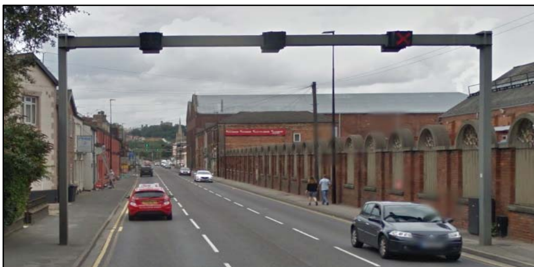
Figure 2: Northbound view of A15 Canwick Road

Recent improvements at the junction of A15 Canwick Road / A15 South Park Avenue & B1188 Canwick Road have seen new cantilever mounted signal equipment replacing the previous gantry structures. These have only been replaced in locations where the signals span two lanes rather than three, it is unknown if there is a limitation.