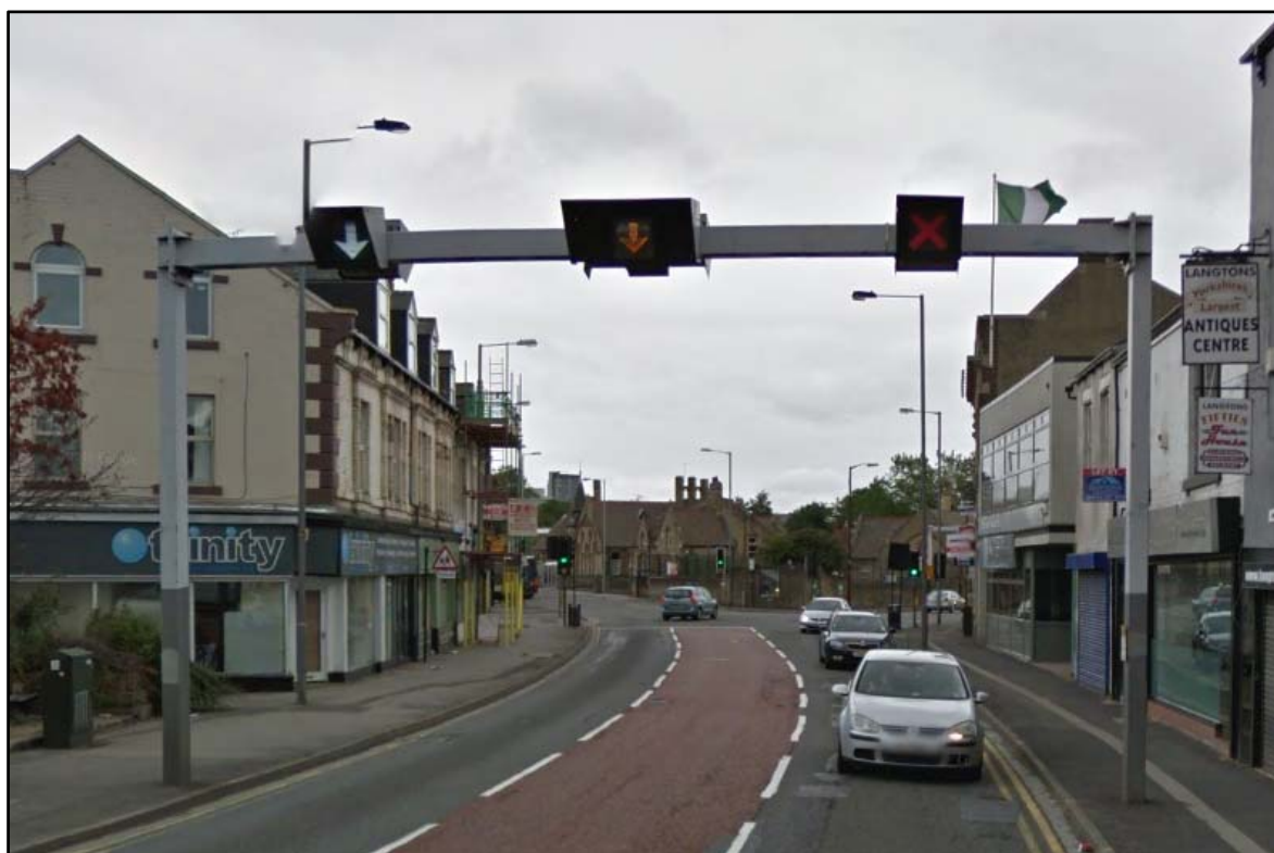
Figure 4: Northbound view of A61 London Road

The overhead gantries take up valuable footway space on both sides of the carriageway however they are less visually intrusive in this largely industrial area