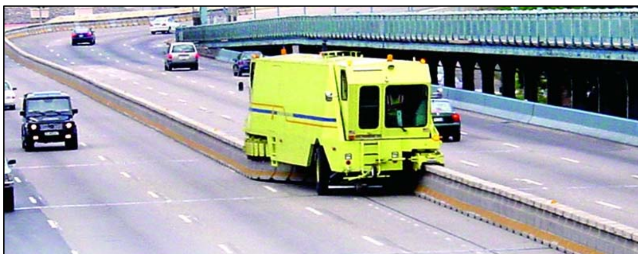
Figure 6: Moveable barrier system in operation