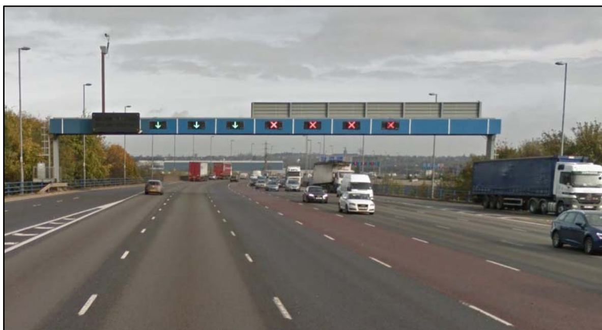
Figure 1: Northbound view of A38(M) Aston Expressway

The lanes are managed with overhead gantries with lane indicator signals to TSRGD Diagrams 5001.1, 5003 & 5005, these are located at regular intervals ranging between 250m and 400m apart. Visually these are similar to gantry lane signage found on a number of motorways and is not out of place in this location.