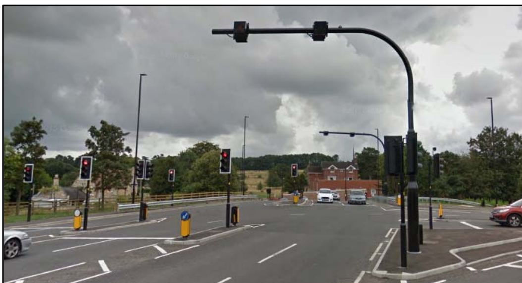
Figure 3: Southbound view of A15 Canwick Road