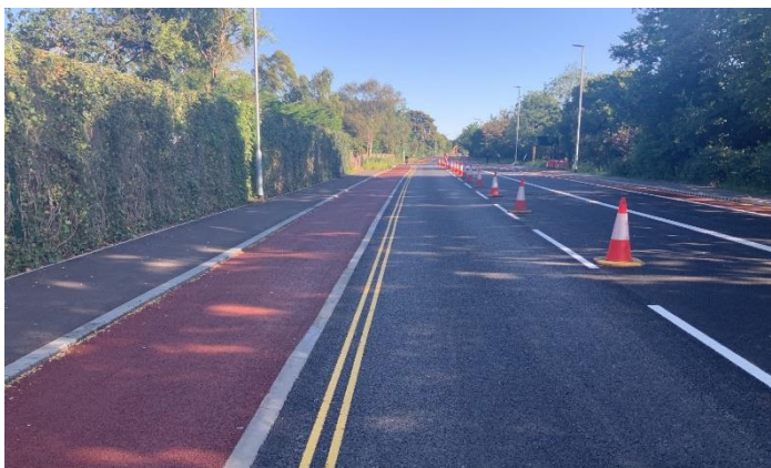
Photograph shows Kings Hedges end of Histon Road.

After the recent round of overnight closures, the resurfacing from Brownlow Road to Kings Hedges is now complete.