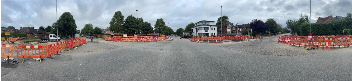
*Photograph shows Gilbert junction.

We are continuing to work on the Gilbert Road junction. To allow the junction to remain open to traffic we can only work on half the junction at a time. We are currently working on the northwest side, installing islands for pedestrian crossings, cycle lanes and walkways.