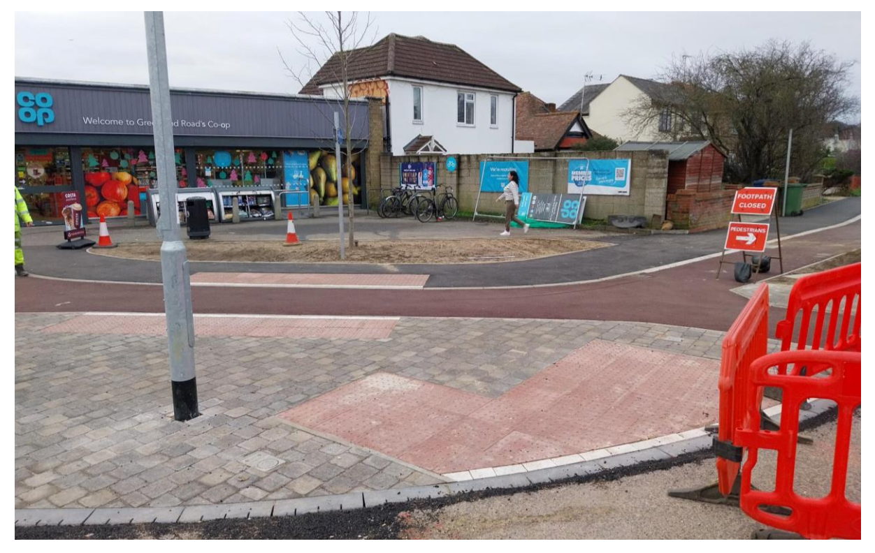
View of the south-east quadrant of King's Hedges junction

As works at the King's Hedges junction progress, the south-east quadrant is now open as far as the Co-op. Works are continuing along the side of the Co-op on Green End Road and will be completed early in the New Year. This will mean that work on the King's Hedges junction is more than 50% complete.