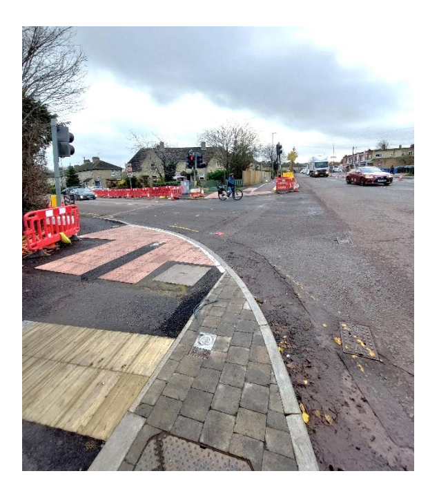
Union Lane / Milton Road junction

We appreciate this will be disruptive to the local area. However, by carrying out the works in this manner we hope to reduce the overall impact of