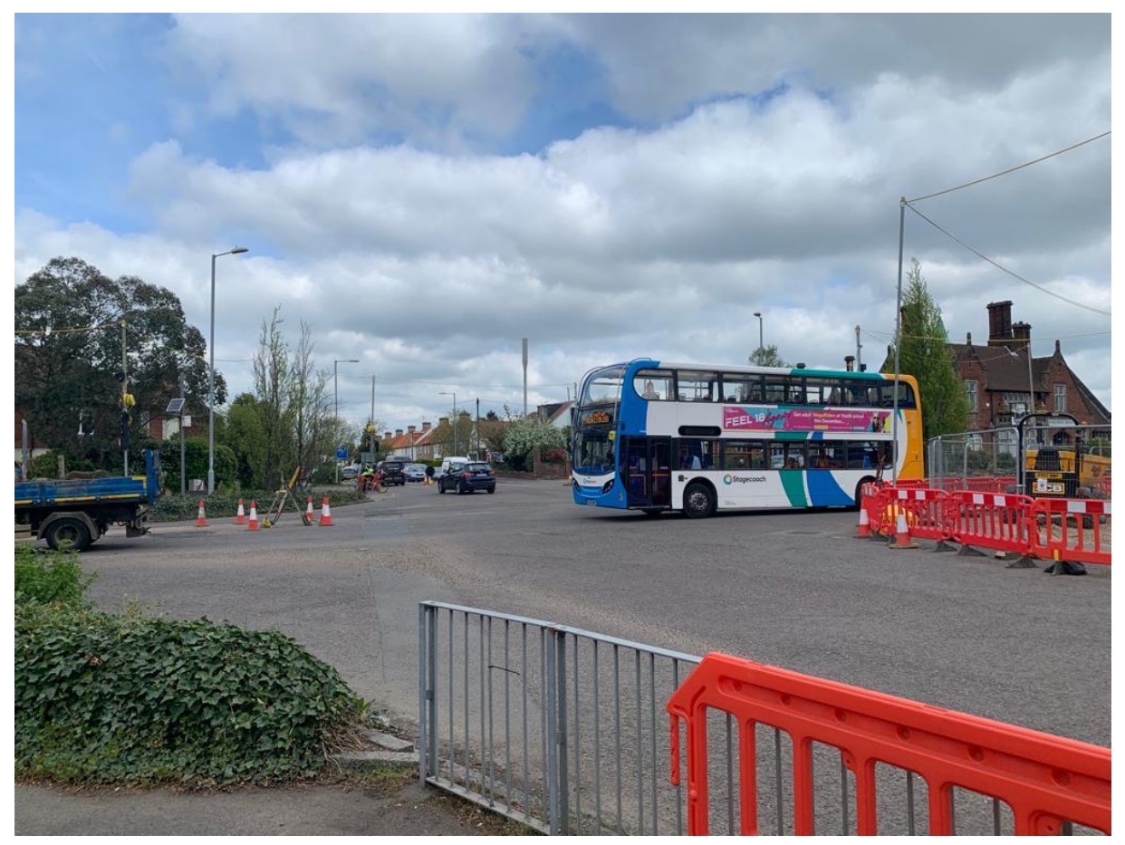
Earlier photo of the south-west quadrant (left) taken from the south-east quadrant

Work on the south-west quadrant is scheduled to start on 4 January 2024.