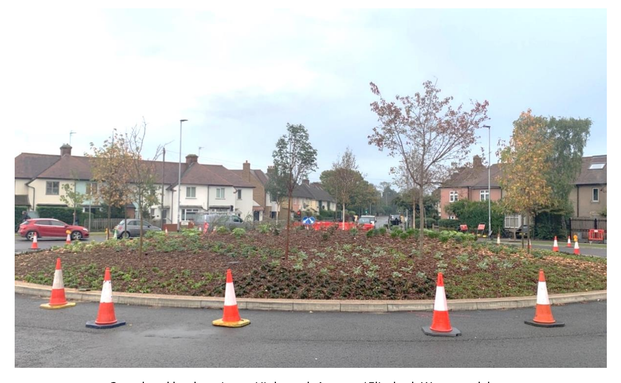
Completed landscaping at Highworth Avenue / Elizabeth Way roundabout

Since the community planting, all landscaping on the roundabout is now complete.