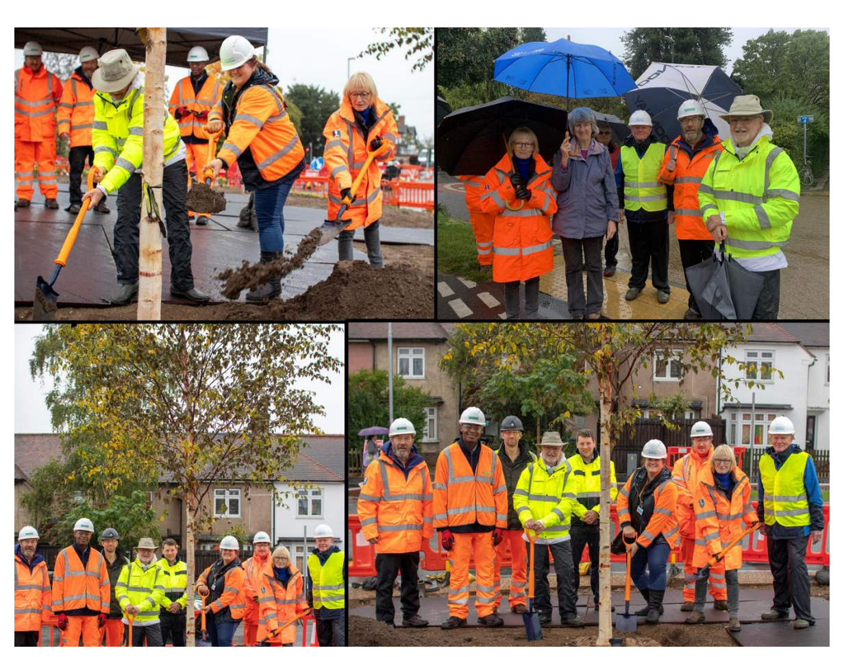
Tree planting event at the Highworth Avenue / Elizabeth Way roundabout