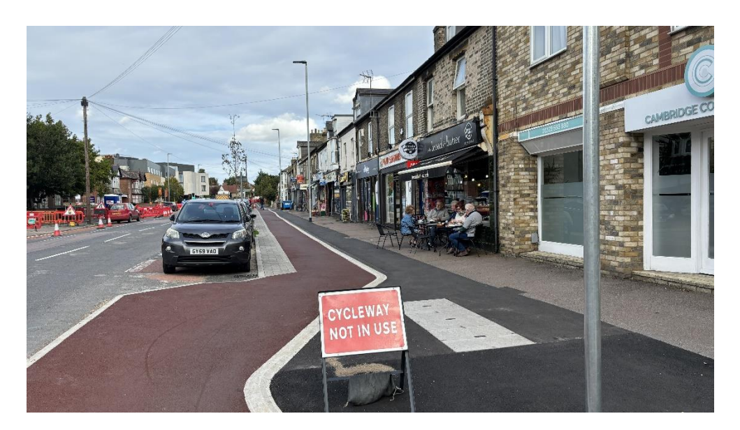
Mitcham's Corner: top photo: September 2021 and bottom photo: October 2023, with work underway

There is space for vehicle doors to be opened without impacting the cycle lane or footpath and there is now additional space for pedestrians to walk, or even enjoy a morning coffee.