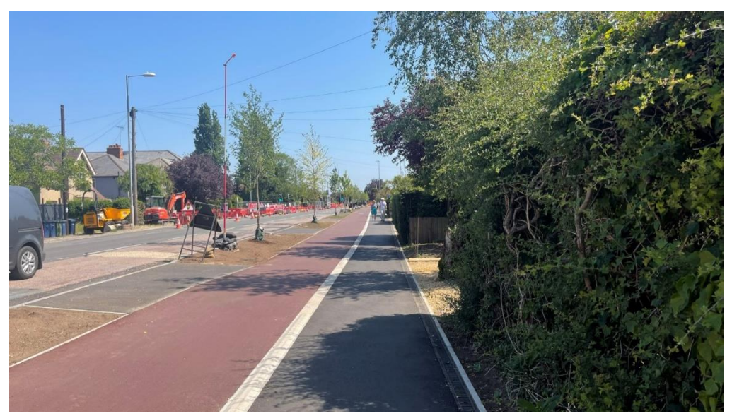
*Completed section between Fraser Road and south of Cook Close

From the north of Union Lane to Cook Close, the pedestrian walkway and cycle lane are now open for use. The final surfacing from Union Lane to the Milton Arms is yet to be laid and is scheduled to be completed at a later date. The section between Fraser Road and south of Cook Close is now complete, with works between Milton Arms and Fraser Road having not yet started. Works will now switch to the western side with remaining works on these eastern sections to be completed later on in the programme.