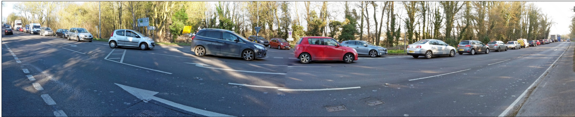
Photo B: 08:36 26 Feb 2019 – A1303 (Madingley Rise) gridlock continues... No access at Girton Interchange