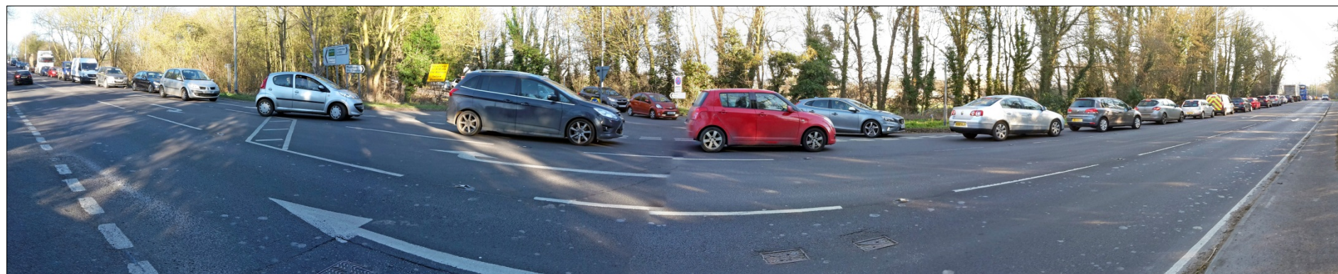
Photo B: 08:36 26 Feb 2019 – A1303 (Madingley Rise) gridlock continues... No access at Girton Interchange