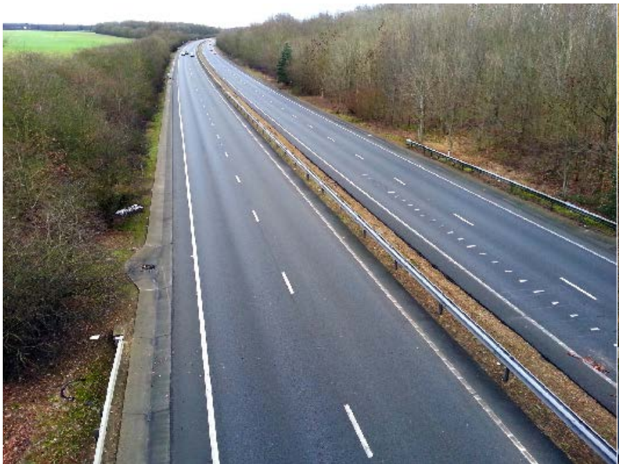
Photo A: 01 Feb 2016, 08:50 am (peak) - A428 looking east from Madingley bridge over A428 - 4-lane highway, 1800 m to M11 - Lack of congestion - No eastbound connection or access to M11