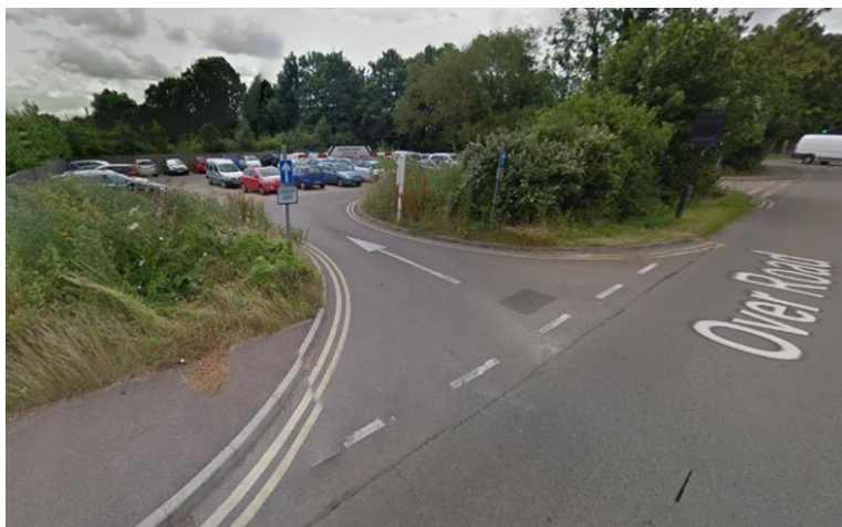
Image 2: Google Streetview of the entrance to the Swavesey car park and pick up/drop off facilities.

Images 1 & 2 above show the location of the car park and pick-up/drop-off point. The guided busway stops, together with the car park and associated cycle parking form the transport facilities at Swavesey that are the subject of this survey.