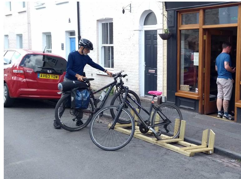
Better uses for our streets